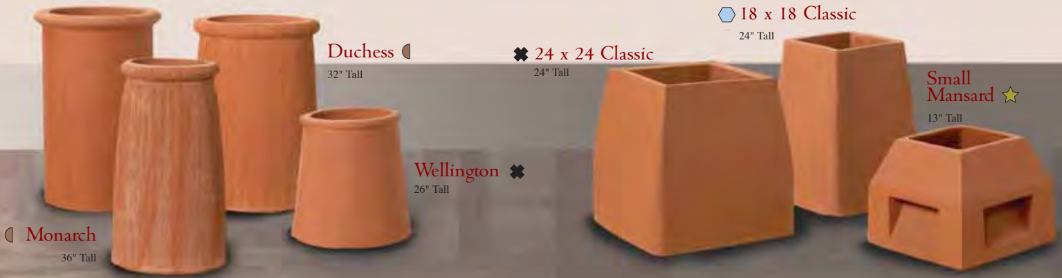
Monarch 36" Tall