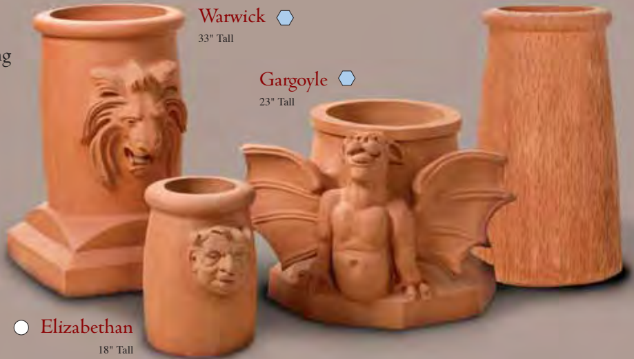
Warwick 33" Tall