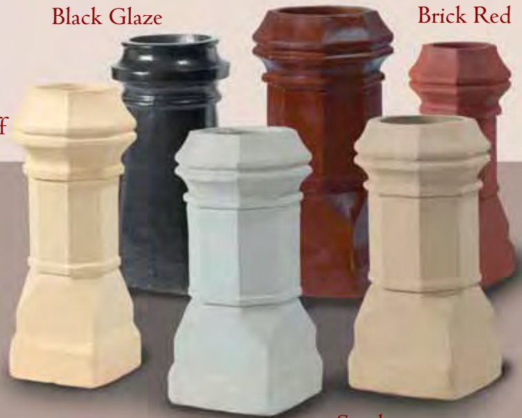
Blue Limestone (also available in Gray Limestone)